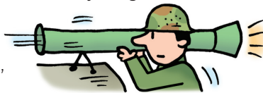
circa 1952

In 1953, General Randolph Pate officially made her Sergeant Reckless . She lived the last 14 years of her life at Camp Pendleton in California.